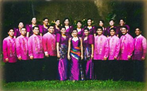
CORO CANTABILE Filipino Choir